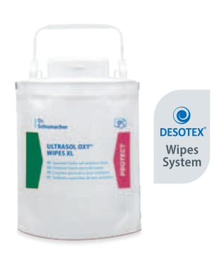
ULTRASOL OXY® WIPES XL